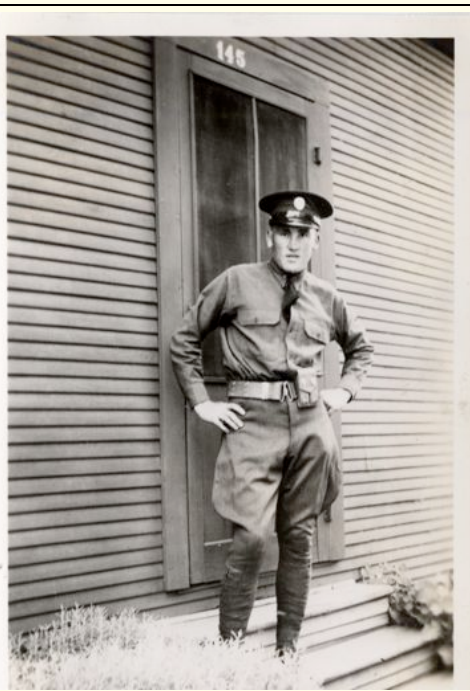
More pictures on page 4