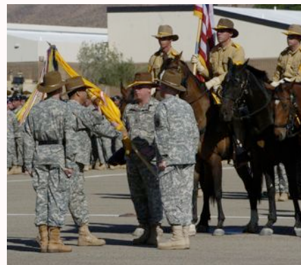
64th Colonel Assumes Command