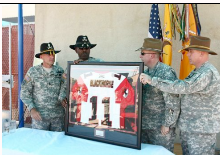
Lucky 16 = 11th Cavalry (the most) 3rd Cavalry + 2nd Cavalry